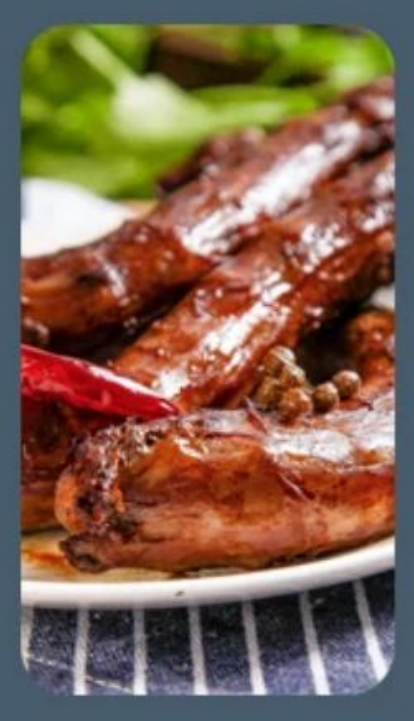
Preserved Duck Neck