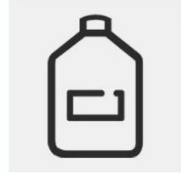
cooking oil cap