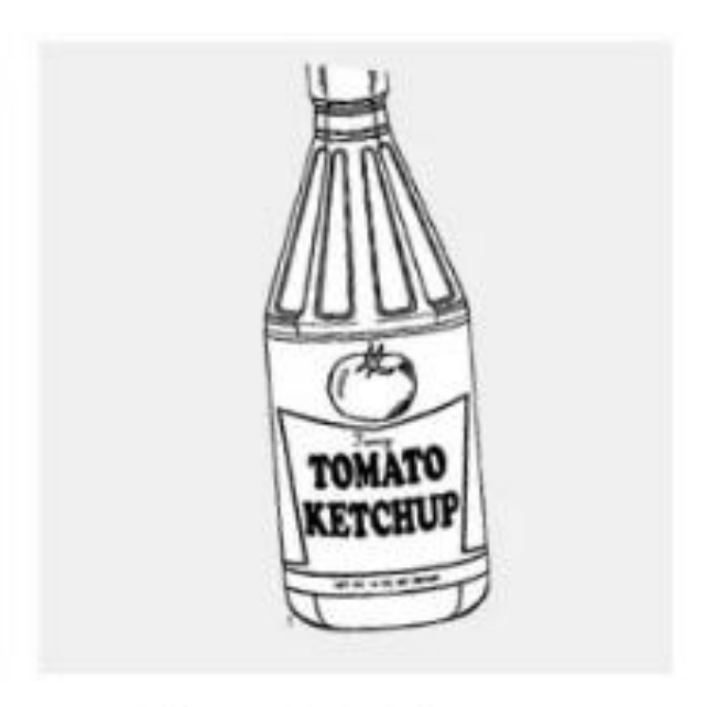
beverage bottle cap