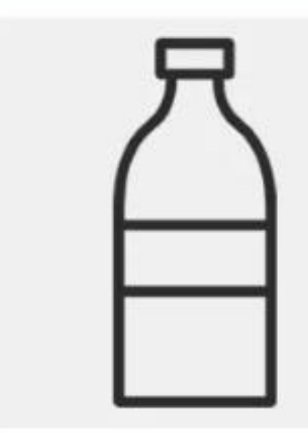
mineral water bottle cap