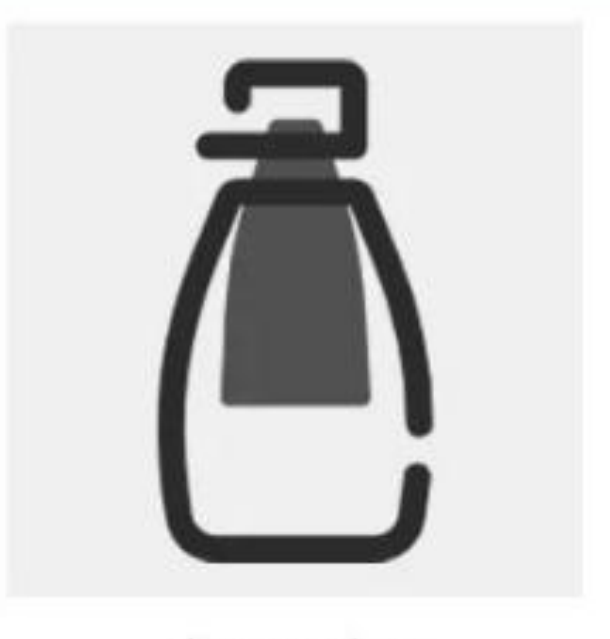
shower gel cap