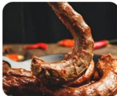
Preserved Duck Neck