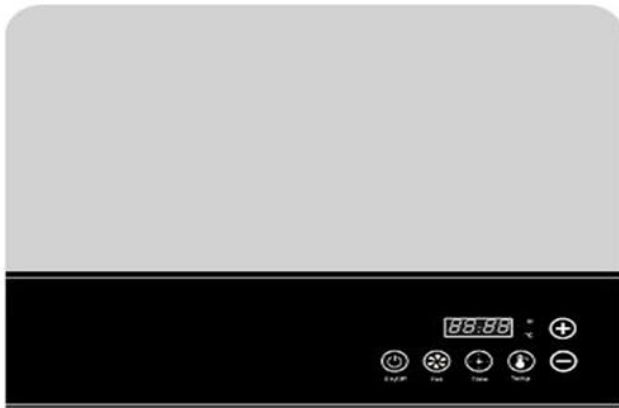
Digital control system