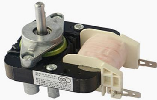
maintenance-free Shaded pole double ball motor