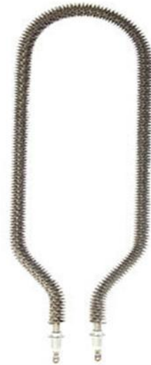
Energy-saving infrared heating tube