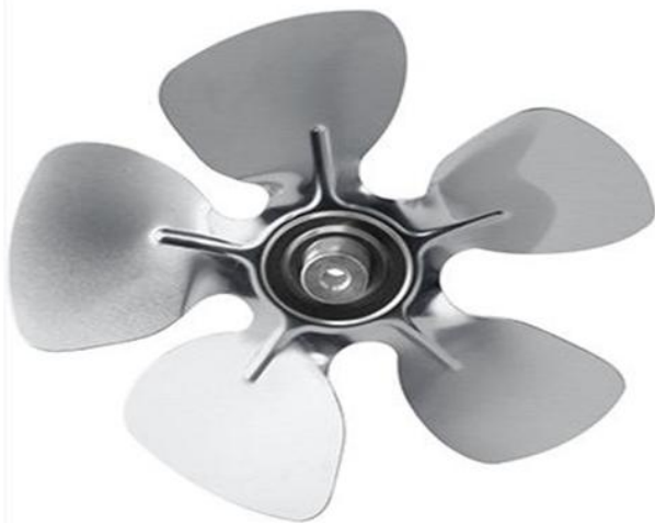
Low noise fan blade with top thermostability