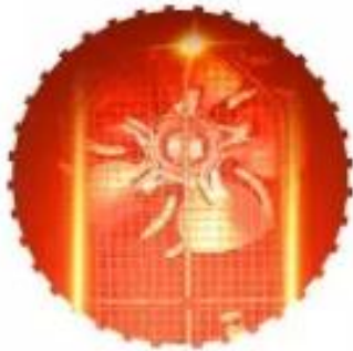
U-Shape Heating Tube