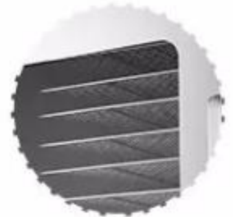
Visible Glass Window