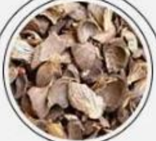
PALM KERNEL SHELL