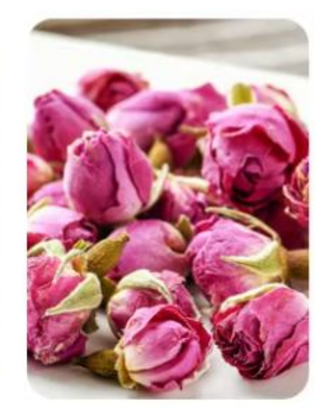
Dried flower tea