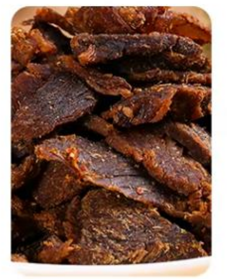
Dried meat jerky