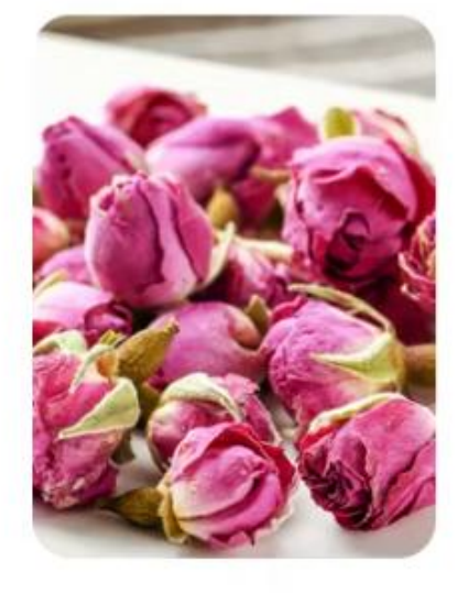
Roasted flower tea