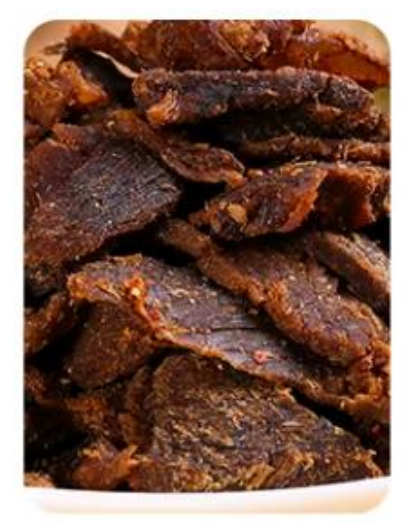
Roasted pork jerky