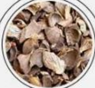
PALM KERNEL SHELL