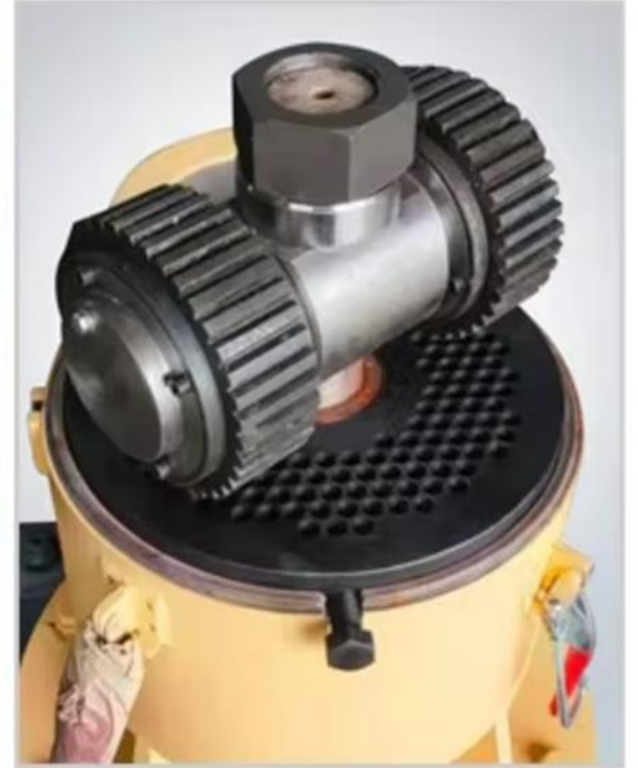
Press Wheel Mill