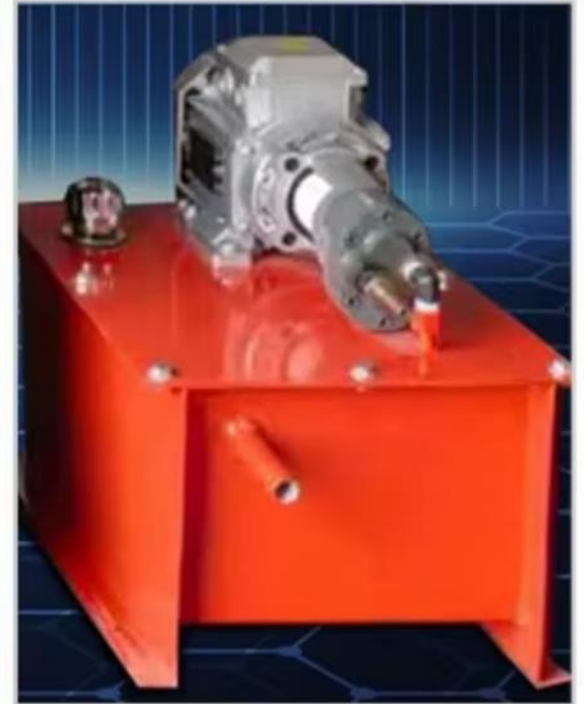
Oil Control System