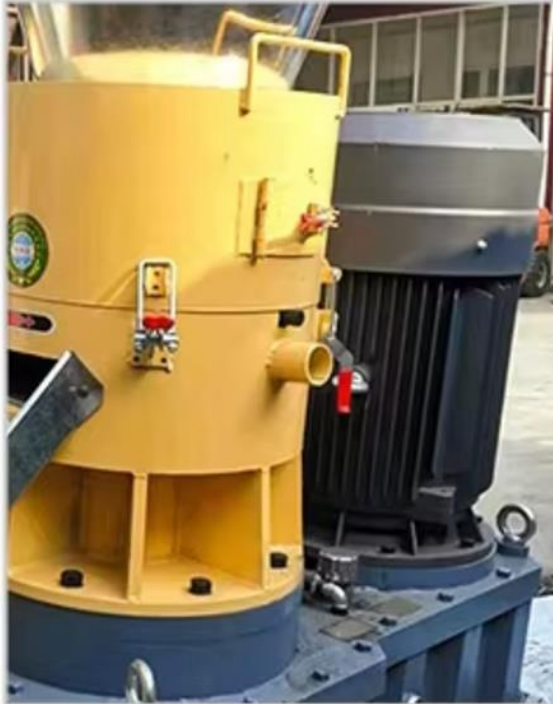
Variable Speed Reduction